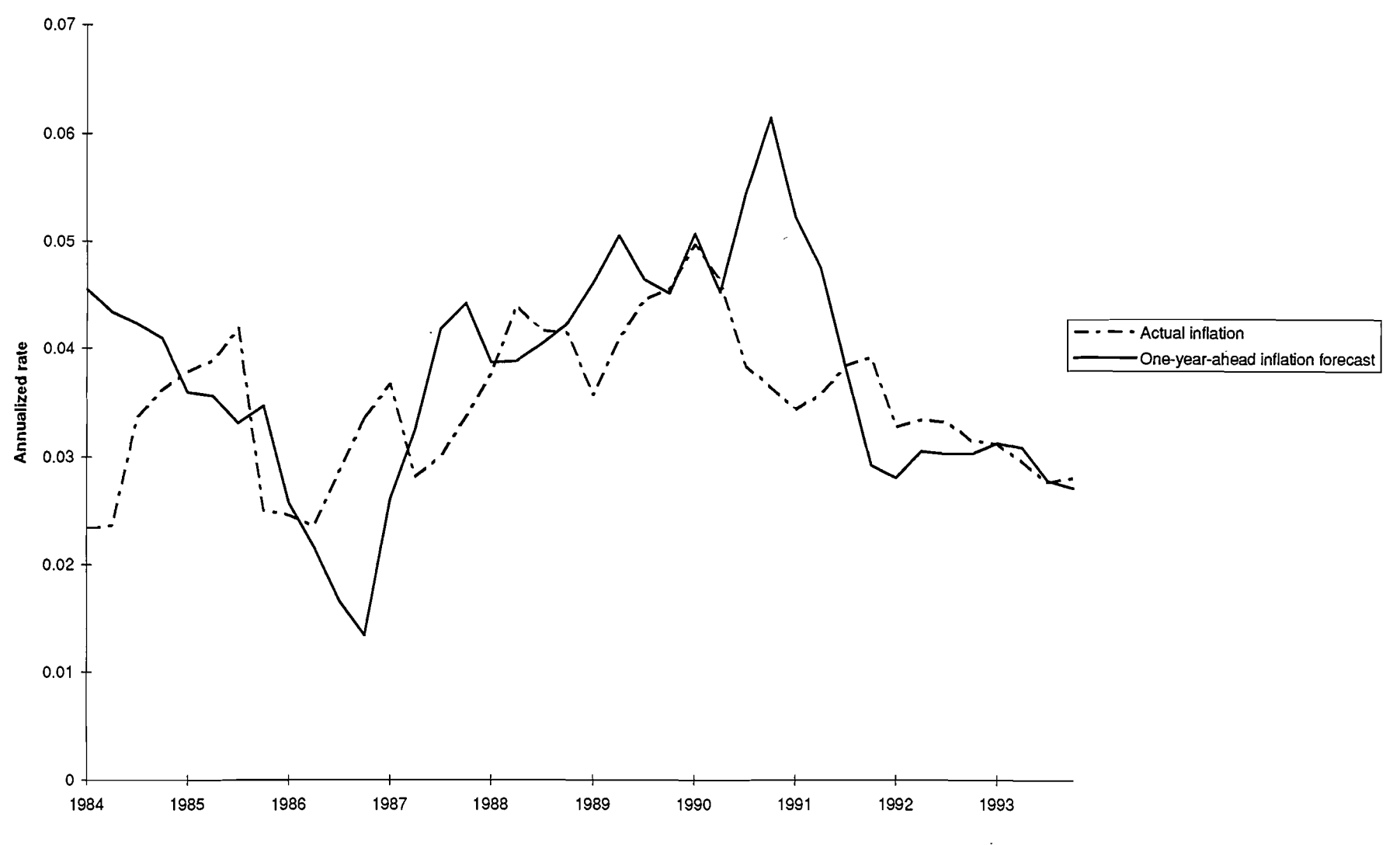
Figure 3: One-Year-Ahead Inflation Forecast