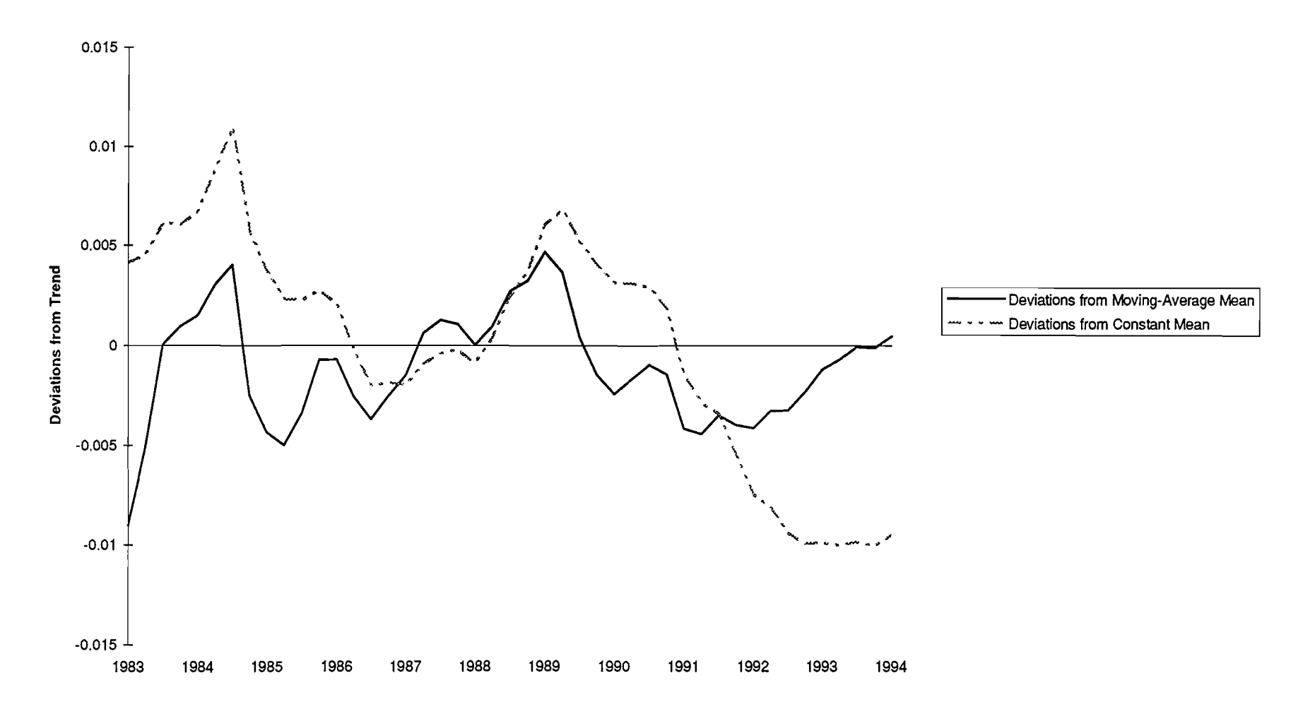
Figure 2: Federal Funds Rate Deviations