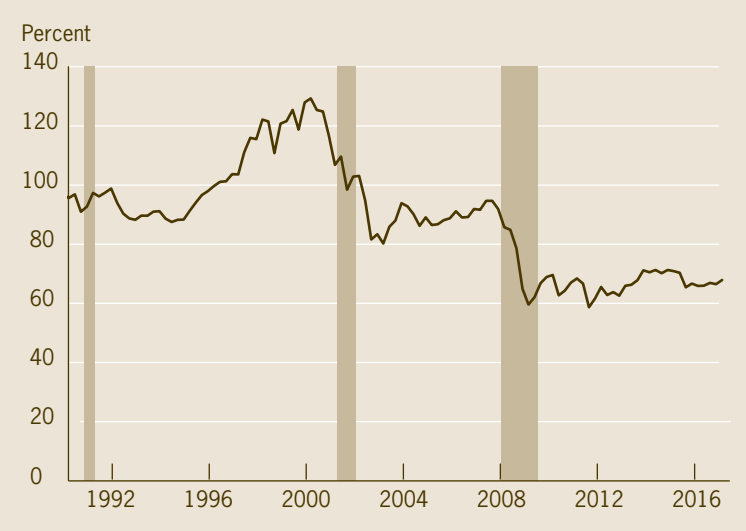
Figure 1. State and Local Government Pensions Funded Ratio

Note: Gray bars represent recessions. Source: Flow of Funds, L. 120.