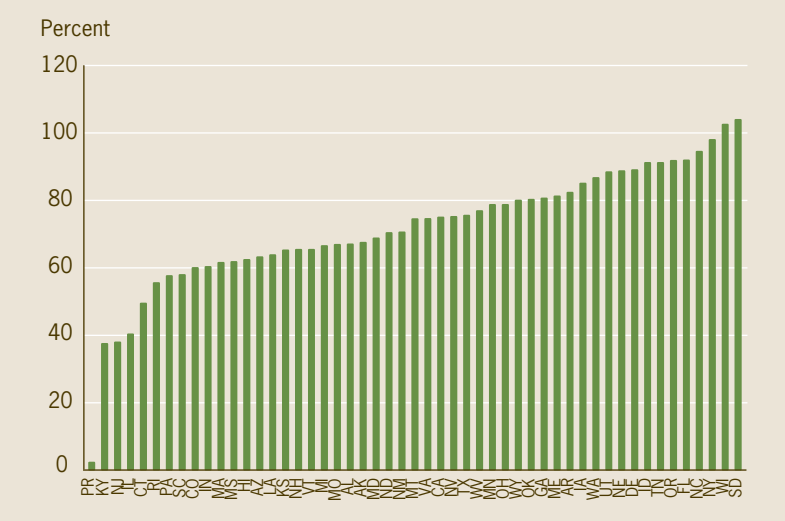
Figure 2. Public Pension Funded Ratios of State Governments, 2015

With so many people depending on public pensions and the challenges governments face keeping them fully funded, it's worth asking how secure pension holders' benefits would be if a state were to default. I consider an extreme case in which the restructuring of all state obligations is necessary for a sustained recovery, very much like the current situation in Puerto Rico.<sup>2</sup> While a state default may be unlikely, considering how it might play out is a useful exercise, as such a crisis could have significant wealth effects on retirees, creditors holding state bonds, and the citizens who depend on public services such as education, healthcare, and infrastructure.