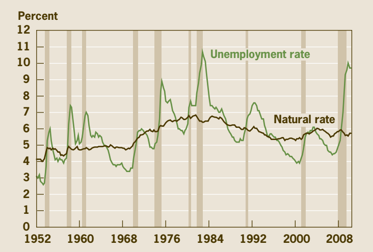
Figure 6. The Unemployment Rate and the Natural Rate