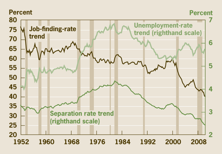
Figure 4. Flows and the Unemployment Rate

Note: The job-finding and separation rates are expressed as probabilities. Shaded bars indicate recessions.