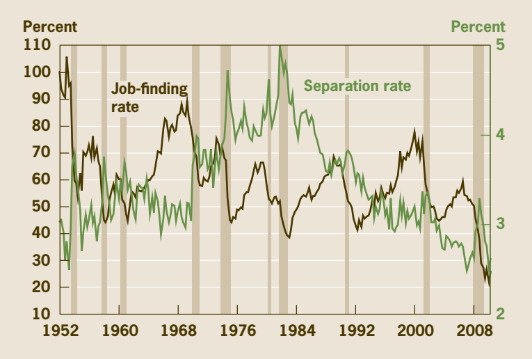
Figure 2. Job Finding and Separation Rates

Notes: The job-finding and separation rates are expressed as probabilities.