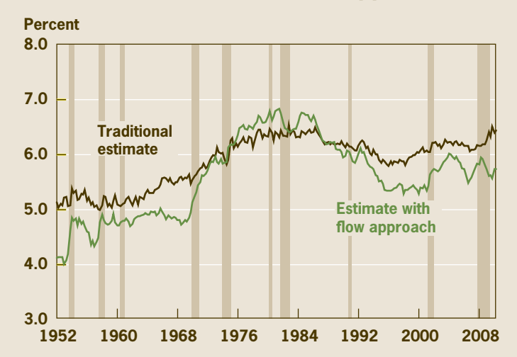
Figure 5. Traditional versus Flow Approach