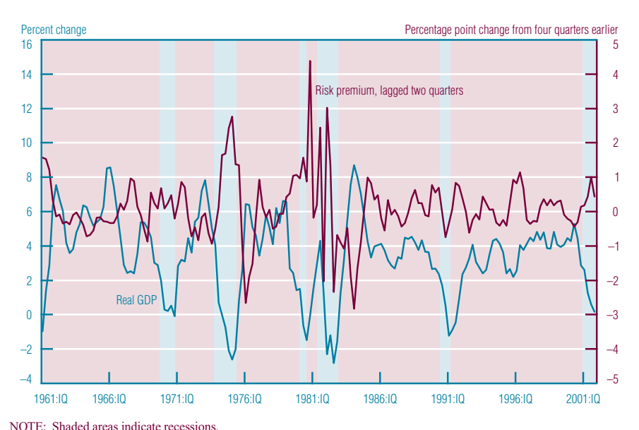
FIGURE 3 CHANGE IN RISK PREMIUM AND REAL GDP GROWTH

SOURCES: U.S. Department of Commerce, Bureau of Economic Analysis; Board of Governors of the Federal Reserve System; and New York Stock Exchange.