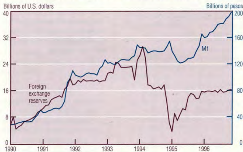
FIGURE 2: FOREIGN EXCHANGE RESERVES AND M1