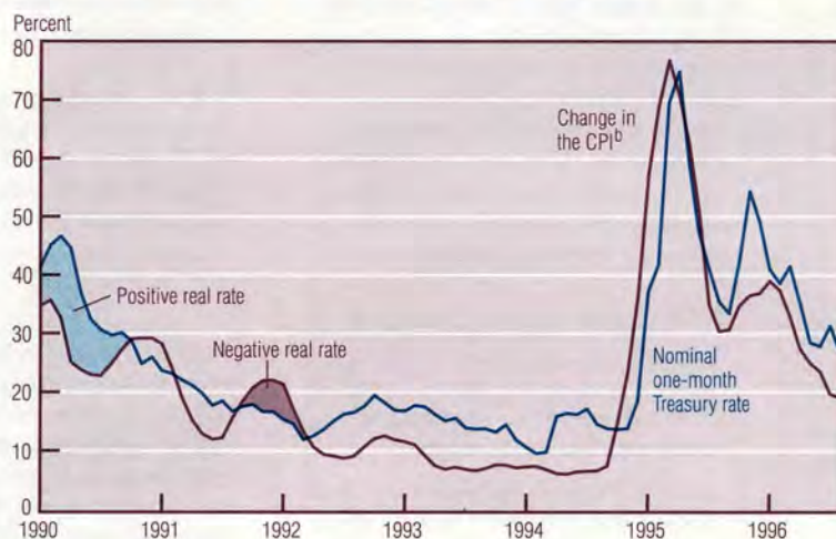
FIGURE 3: REAL ONE-MONTH TREASURY RATE a

a. The real Treasury rate equals the nominal rate minus the change in the Consumer Price Index (CPI).